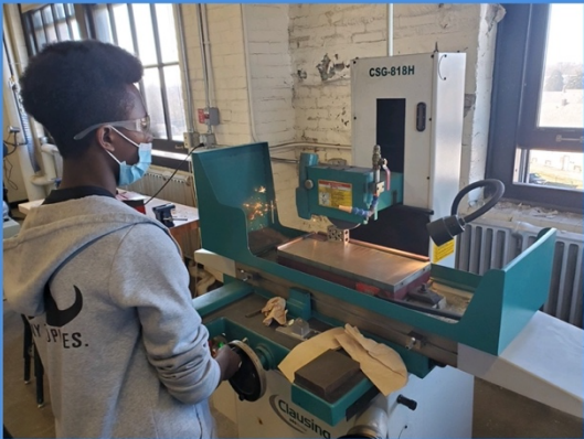
Saturday Burgard Students Investing in Their Futures